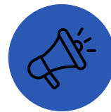
Exhibit to speak directly with potential doctoral students. Exhibit space & registration for up to 4 university reps is included. Now held in conjunction with our Member Association Conference, you can meet both potential faculty & potential doctoral students across disciplines in one trip.